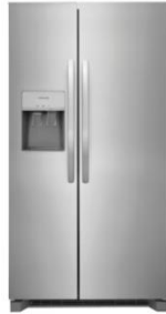
FRSS2623AS Side-by-Side Refrigerator