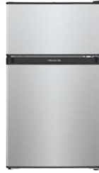
FFPS3133UM Compact Refrigerator